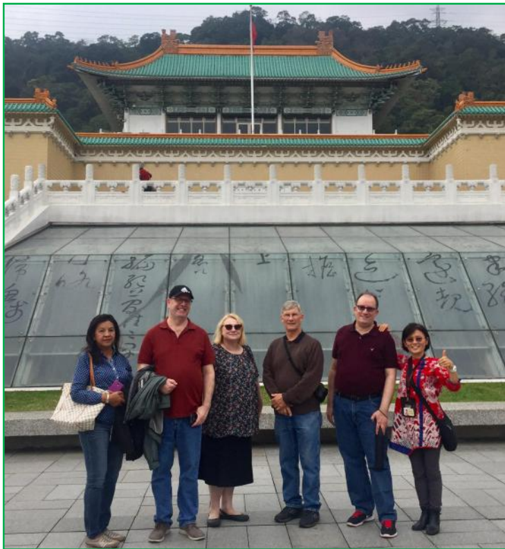
The WASC Visiting Committee in front of the National Palace Museum on the day after their final presentation.