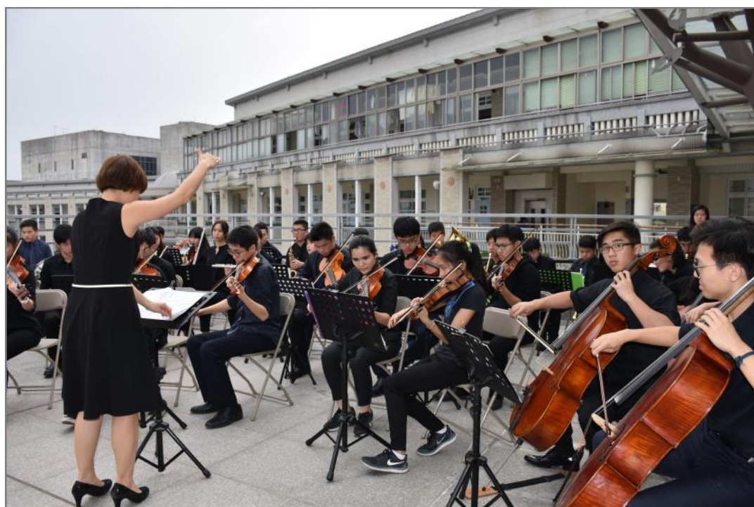
The D'TORCH Orchestra entertained the visitors, students, parents, faculty and staff at the farewell party for the Visiting Committee. The weather was balmy and everyone moved to the open space next to the Science laboratories on the fourth floor for the final and informal farewell. It is the ideal space for open-air gatherings and entertainment. The Visiting Committee members remarked on how they enjoyed the orchestra's rendition of James Bond film music. The music was an excellent choice for the setting and the occasion.