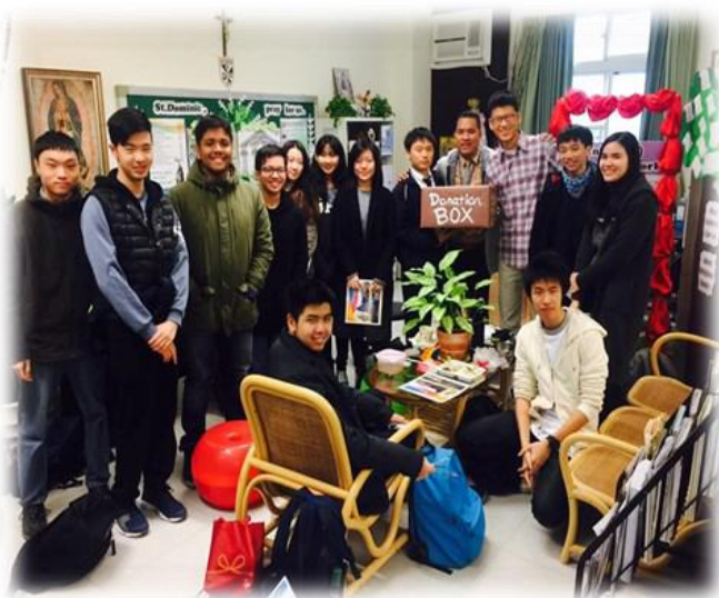
The outgoing DYM Team who had a very successful 2016/17