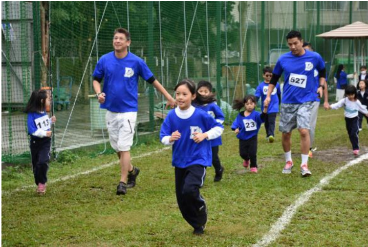
Parents and teachers had great fun participating in the Fun Run

We were celebrating the 60 th anniversary of our school, participating in the fun run as the DIS Family. Sisters, students, teachers, parents, and friends put on their running shoes and had a lot of fun.