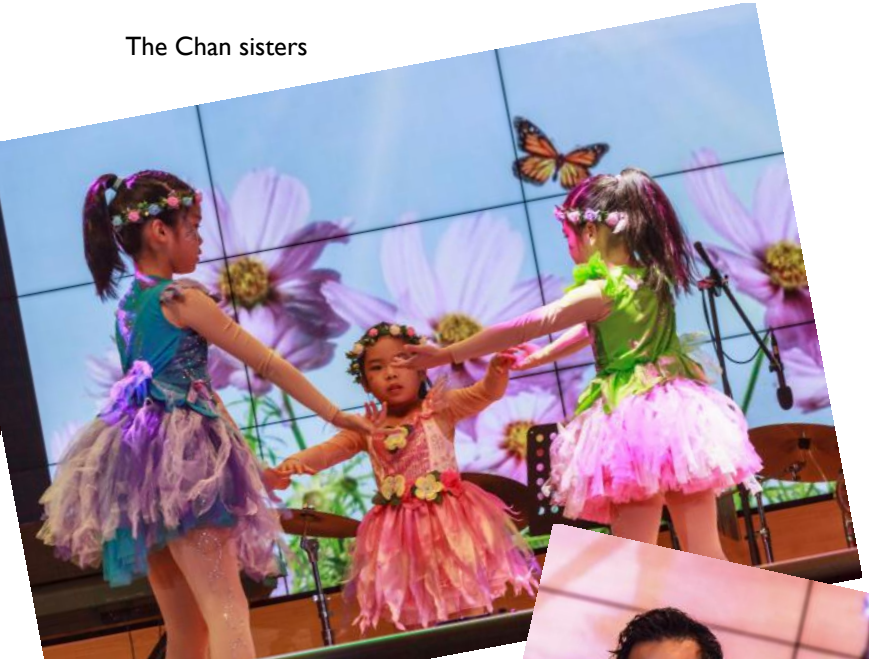
The Chan sisters