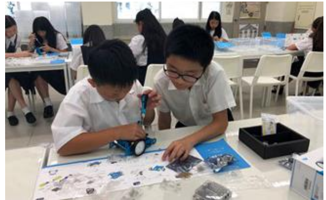
G7 Students assembling the robots

"Robots are interesting because they exist as a real technology that you can really study – you can get a degree in robotics – they also have all this pop-culture real estate that they take up in people's minds." – Daniel H. Wilson