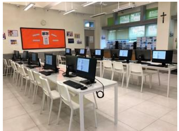
The Robotics Laboratory