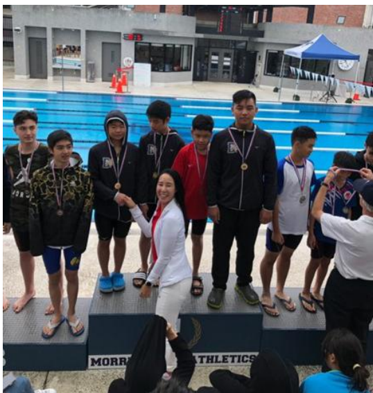
The DIS Swimming Team