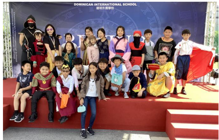
Grade 4 BI John of Vercelli