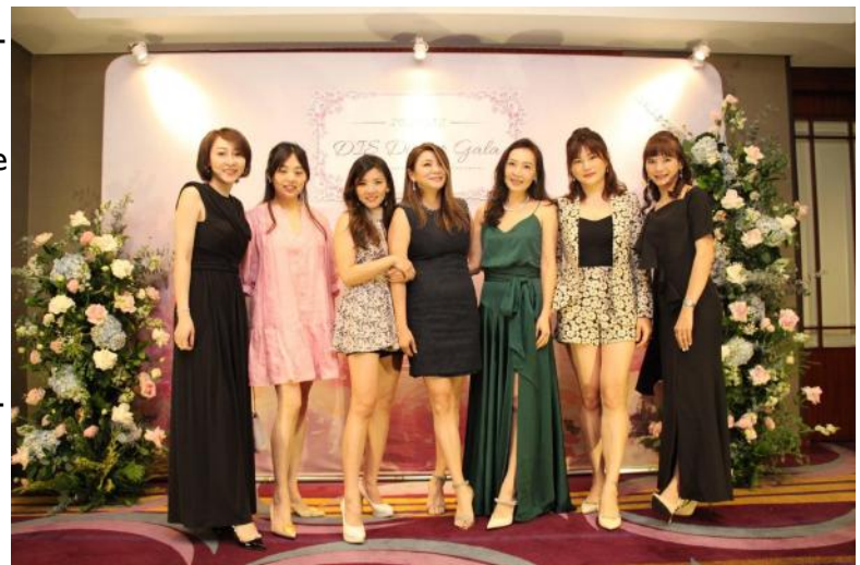
Our gorgeous DIS Moms